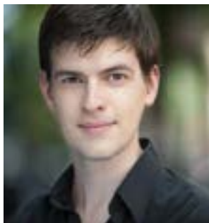
James Camp First United Methodist Church Pine Mountain