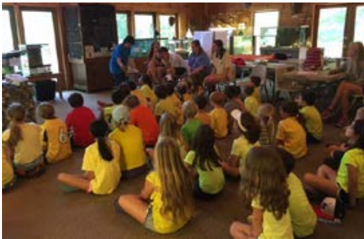
Group field Trips with learning and new experiences