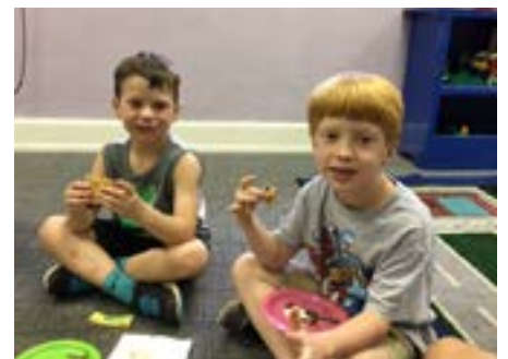
And very importantly...New Friendships Made Each Year