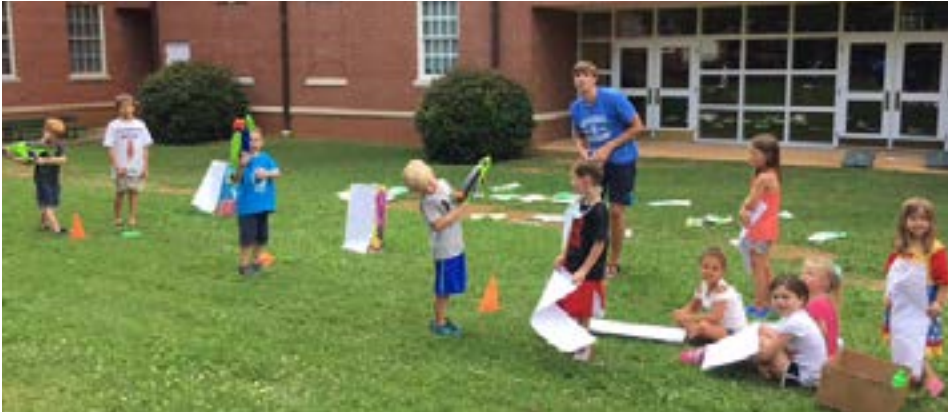
Team Games & Learning Activities by Age Groups