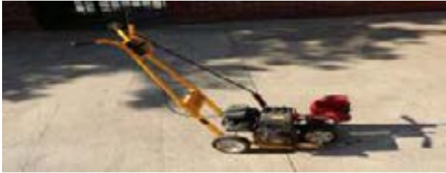
McLane walk behind edger 098793 (#21) ($50.00)