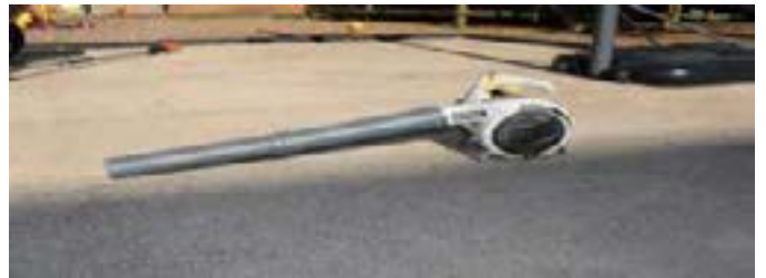
Ryobi Hand Blower (#27) ($20.00)