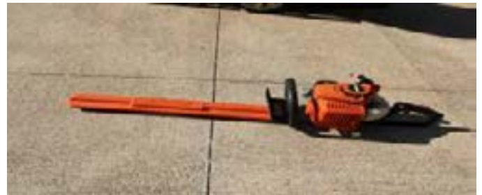
Echo hedge trimmer HC-150 (#17) ($75.00)