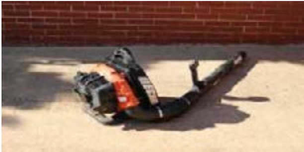
Echo backpack blower PB-500T (#10) ($100.00)

If you are interested in an item, email andy@lagrangefumc.org . Include your bid and the item number. Bidding will close on 7/14. To view the items or ask questions, contact Andy Rainey in the church office.