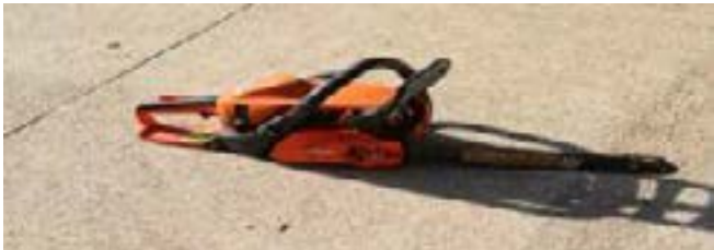
Echo chain saw CS-310 (#23) ($25.00)