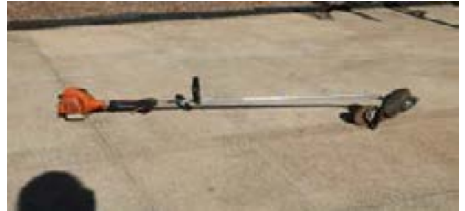
Echo stick edger PE-225 (#15) ($125.00)