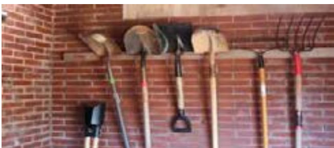
Various hand tools (#24) (Items sold individually) ($5.00 min. bid per item)