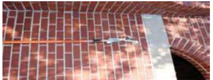
Fiskars limb trimmer (#28) ($20.00)