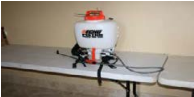
Echo Piston backpack sprayer MS-400 (#22) ($25.00)