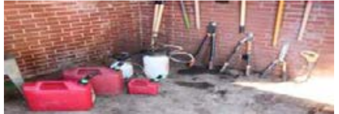
Hand tools, Sprayers & Gas cans (#26) (Items sold individually) ($1.00 min. bid per item)