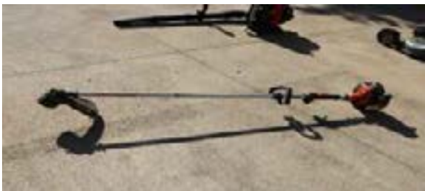
Echo weed eater SRM-230 (#12) ($100.00)