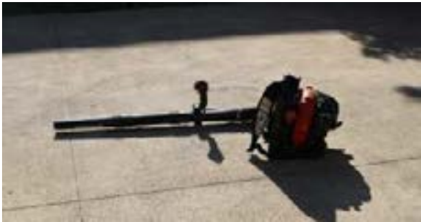
Echo backpack blower PB-500T (#11) ($100.00)