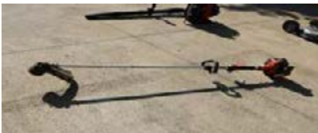
Echo weed eater SRM-230 (#13) ($100.00)