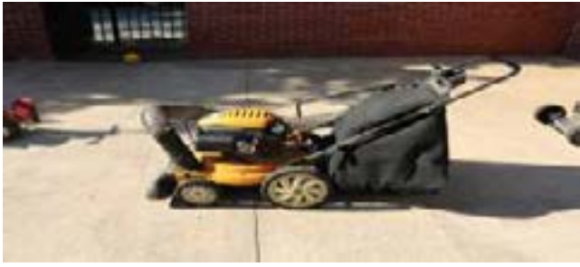
Cub cadet chipper, shredder & vacuum CSV 050 (#20) ($150.00)