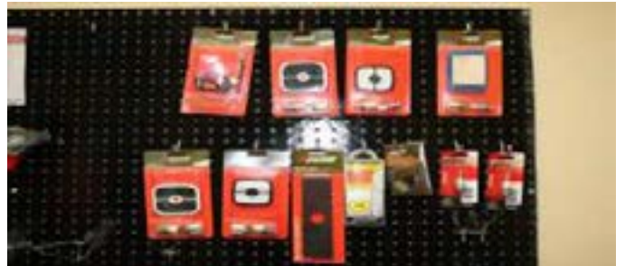
Spare parts (#29) (items sold individually) ($1.00 min. bid per item)