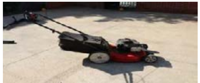
Yard Machines 5550EX Push mower (#18) ($25.00)