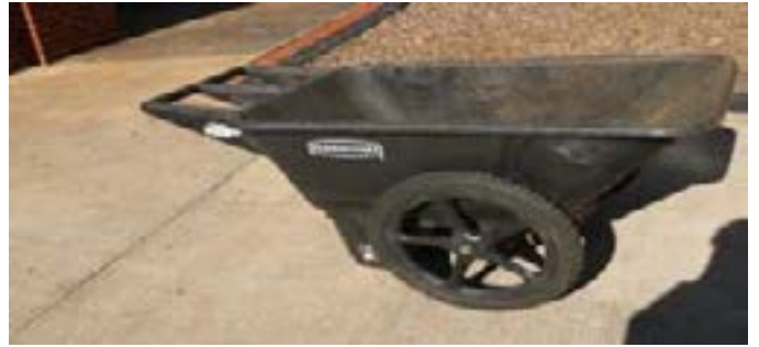
Rubbermaid wheelbarrow (#25) ($25.00)