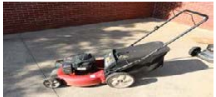
Yard Machines 5550EX Push mower (#19) ($25.00)