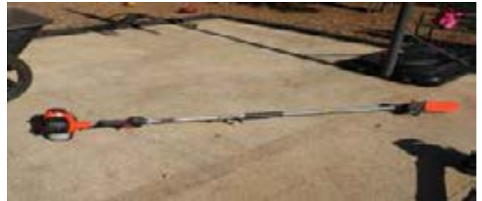
Echo stick chain saw PAS-266 (#16) ($175.00)