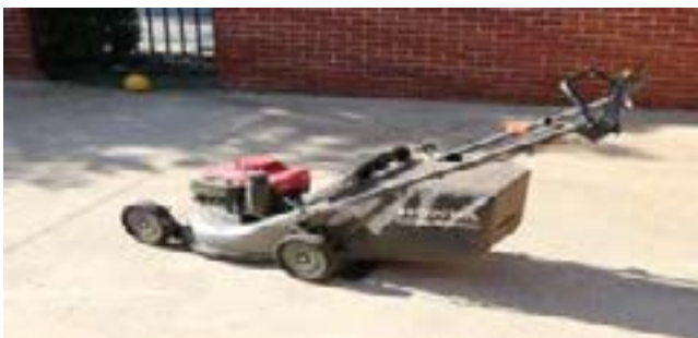
Honda Commercial Mower HRC 216 (#14) ($750.00) Original cost $1,200.00 bought 08/15/2016