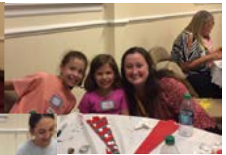
Girls' Nite Out

Over 40 girls participated in this year's Girls' Nite Out.