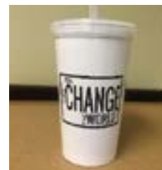
Rise Against Hunger