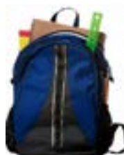
Blessings in a Book-Bag