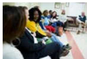
Circles of Troup County