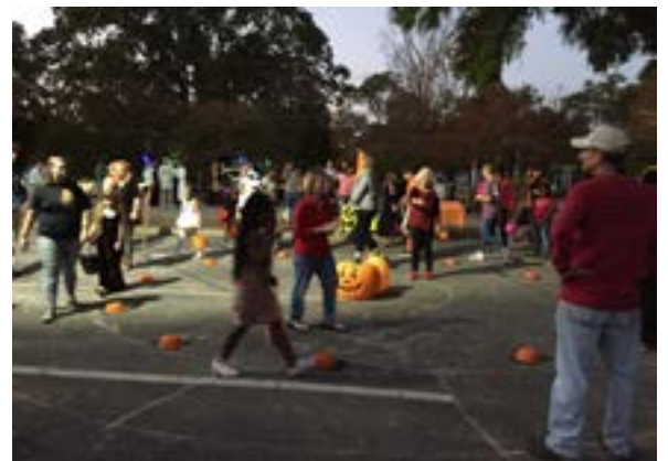
Thank you to all who supported this year's Trunk or Treat Event. We had a record crowd!

2016 Charge Conference Sunday, November 13th 5:30pm, Fellowship Hall